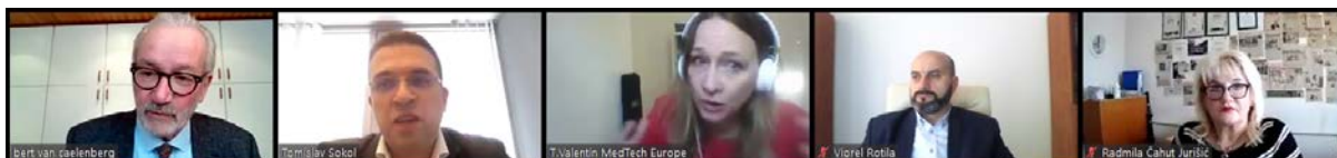
Speakers at the Webinar

On the one hand, the Coronavirus crisis has made the countries aware that there is a need for acting together, but also that it will be difficult to bring all member states aboard when it comes to changing the Treaty with a view to implementing minimum standards of healthcare and minimum wages for the healthcare staff. The EU has some power through article 168, but it is still the member states which have the final power when it comes to regulating their healthcare sector.